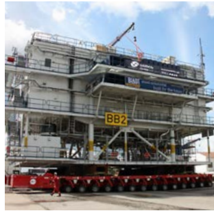
2016 Bligh Bank