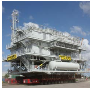
2010 Walney I