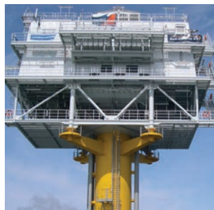
2007 Princess Amalia