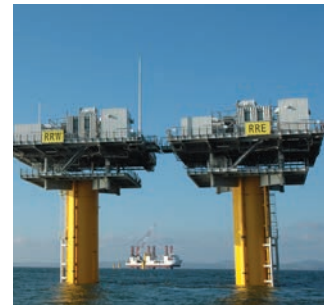
2008 Robin Rigg