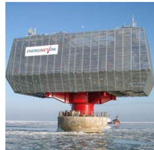
2009 Rodsand B