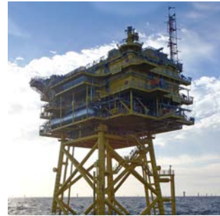
2016 Nordsee One