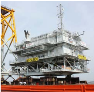
2011 Walney II