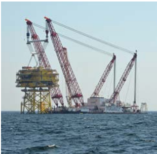
2014 Nordsee Ost