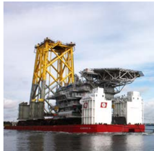
2013 Borkum Riffgrund